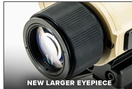
NEW LARGER EYEPIECE

Rechargeable & Interchangeable Battery A common 18650 rechargeable battery cell provides 4+ hours of run time.